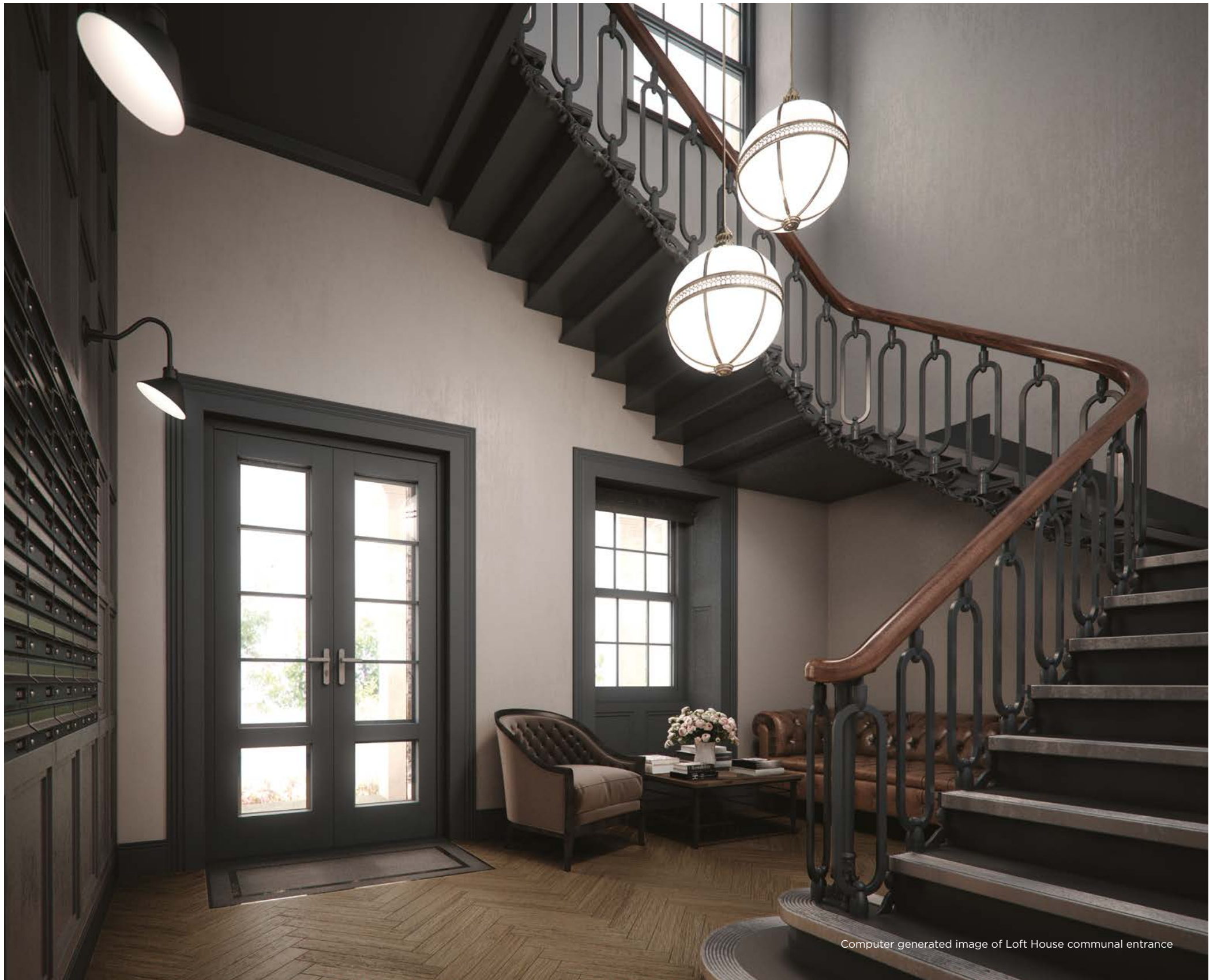
Computer generated image of Loft House communal entrance