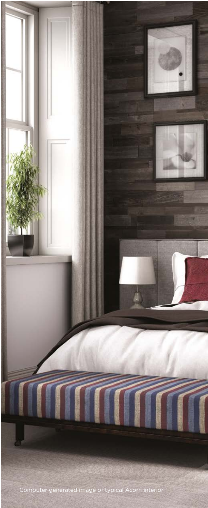
Computer generated image of typical Acorn interior