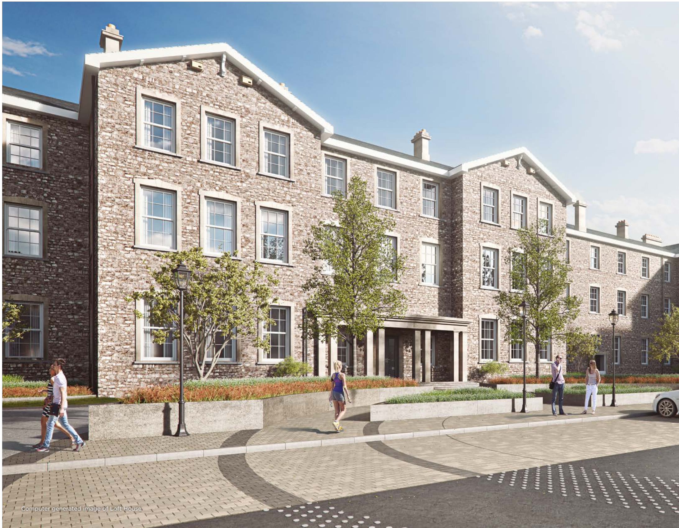
Computer generated image of Loft House