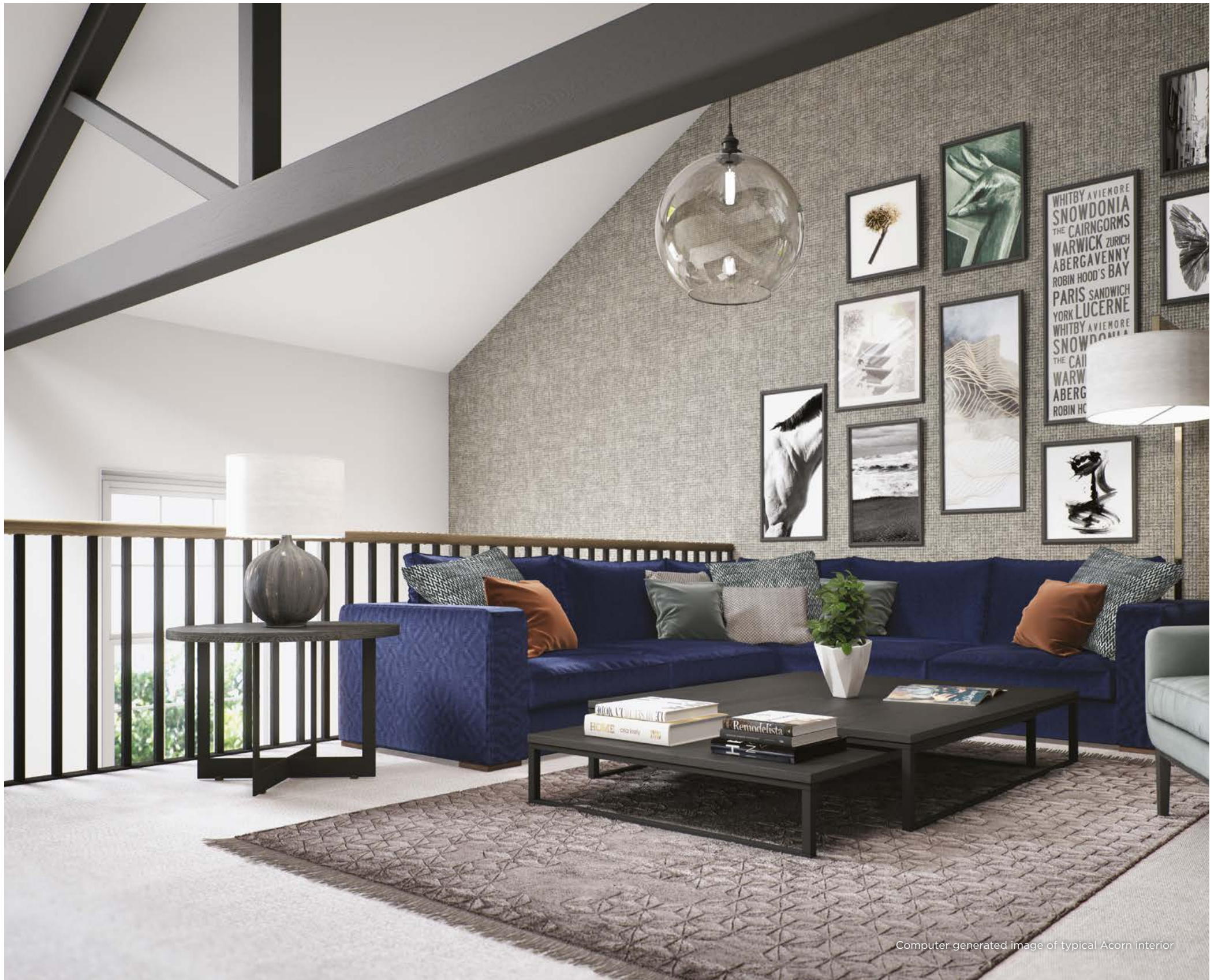
Computer generated image of typical Acorn interior