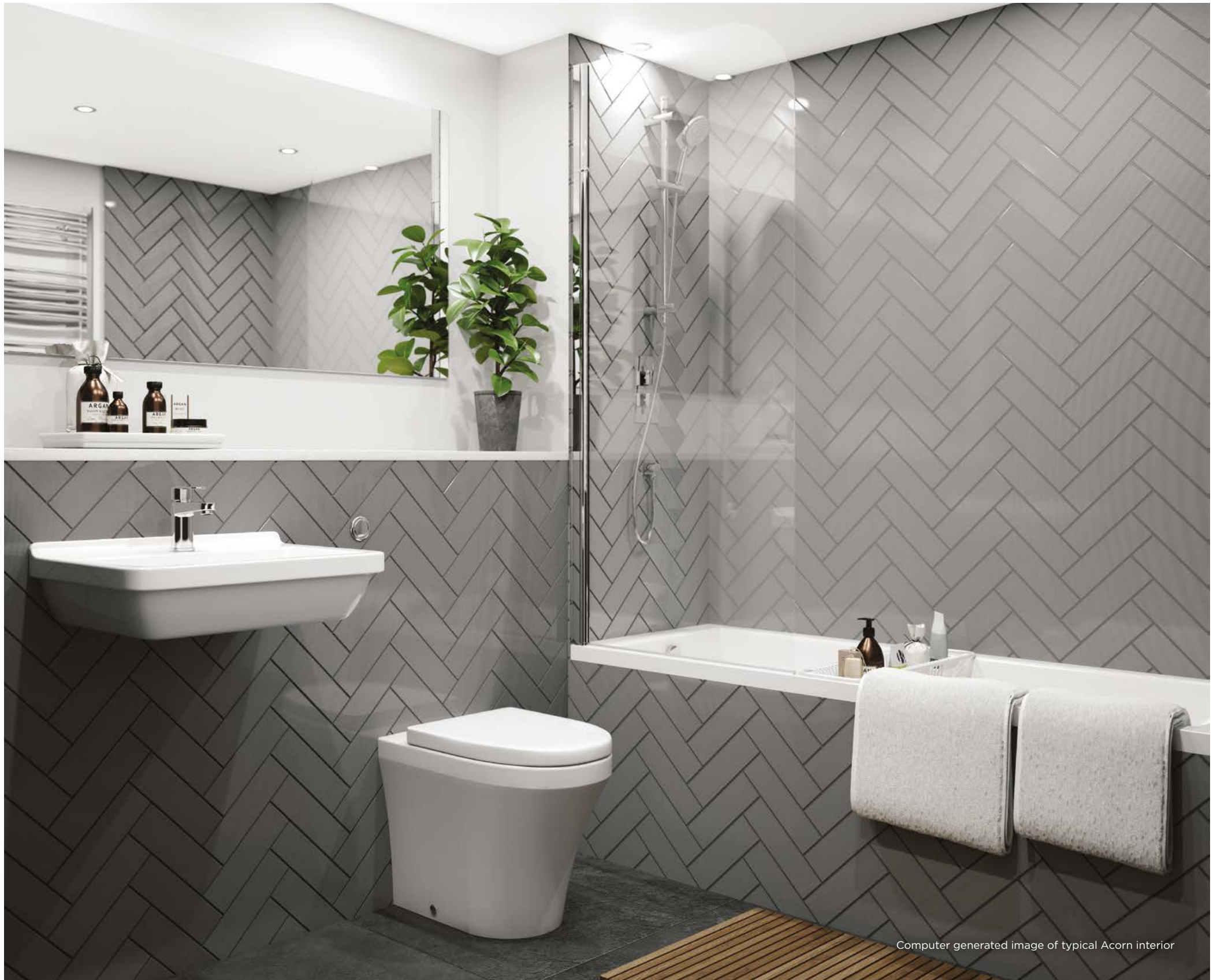
Computer generated image of typical Acorn interior