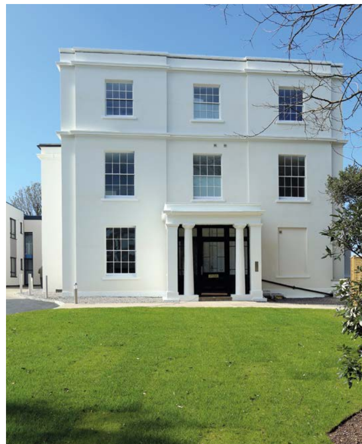
Previous Acorn Developments